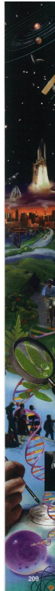
ILLUSTRATION: TERESE WINSLOW

“SCIENCE DOES NOT ENTER A CHAOTIC SOCIETY TO PUT ORDER INTO IT ANYMORE... BUT TO ADD NEW, UNCERTAIN INGREDIENTS... TO THE COLLECTIVE PROCESS.”